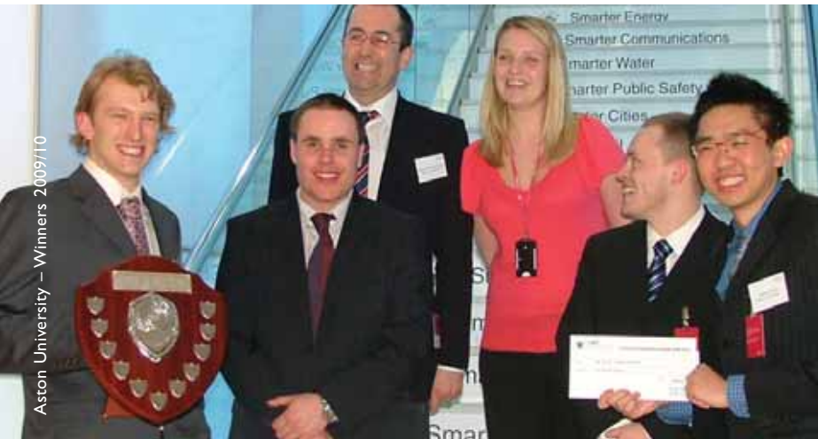
Aston University – Winners 2009/10

Can your university afford to miss it in 2010/2011?