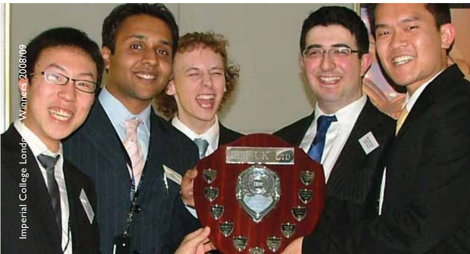
Imperial College London - Winners 2008/09

The premier undergraduate business competition in the UK